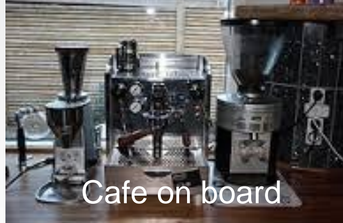
Cafe on board