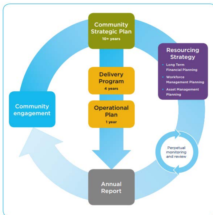
Figure 1: Integrated Planning and Reporting Framework (IP&R)