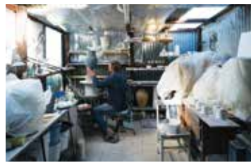
Image: Frank Hurley and Monte , late 1950s.

This exhibition casts new light on the life and work of Frank Hurley (1885-1962), revealing his early Sydney photographs, tourist postcards and later studies of Australian wildflowers. Best known for his war and Antarctic expedition photography, Hurley spent 22 years living on Collaroy Plateau from where he travelled Australia to produce books, photographs and postcards. Images are drawn from the National Library of Australia, private collections and family archive. This exhibition is funded through the Theo Batten Bequest and is part of the 2018 Head On Photo Festival. Curated by Gael Newton and Paul Costigan.