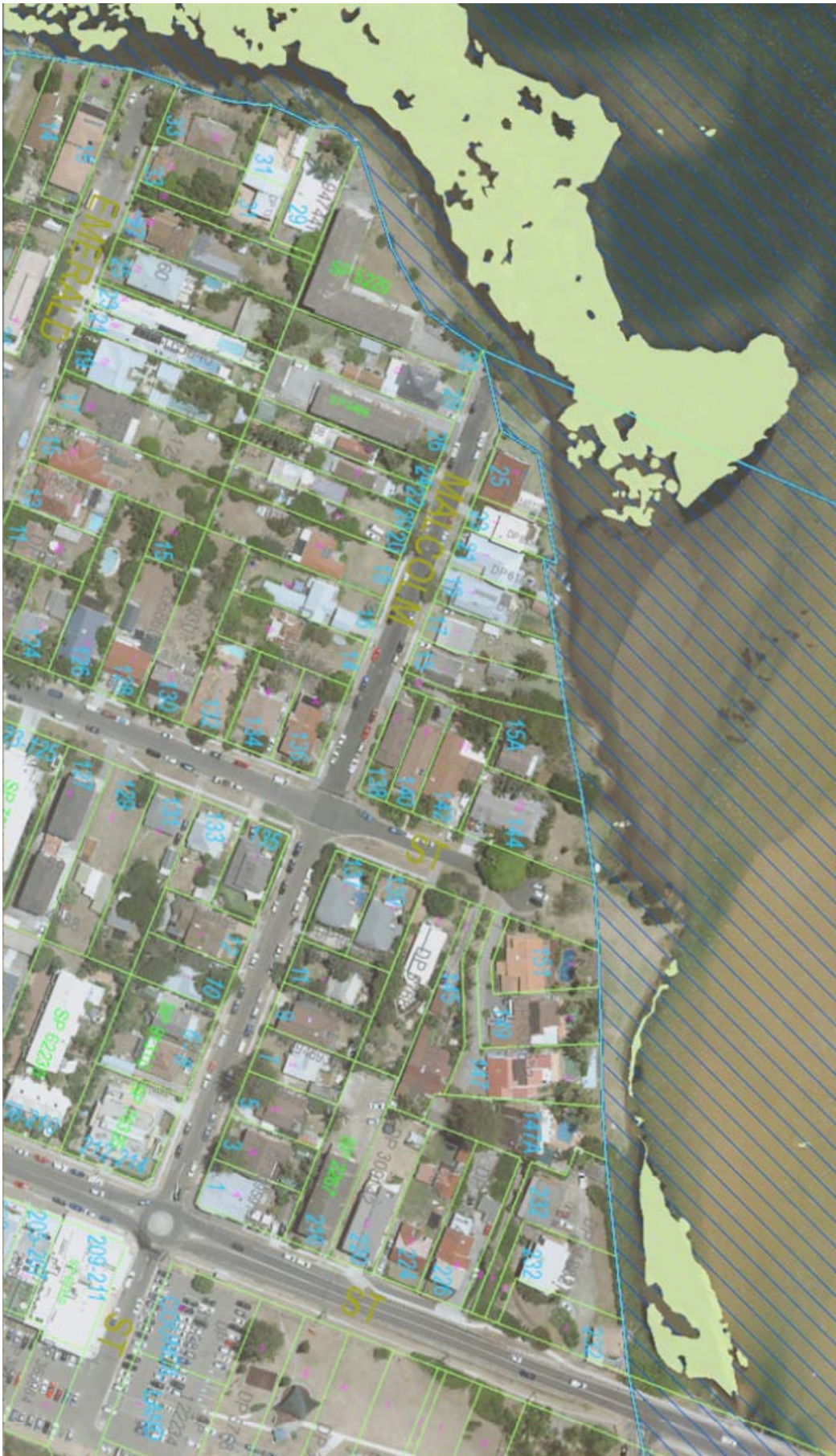
Northern Section, showing seagrass, cadastre and NLSP boundary