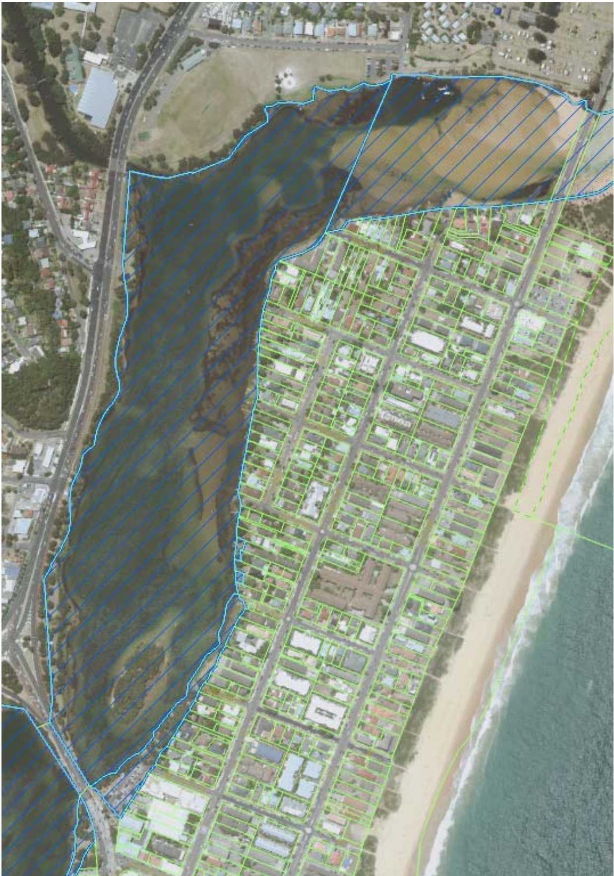
Narrabeen Lagoon Eastern Channel, site of suggested walkway showing cadastre and NLSP boundary