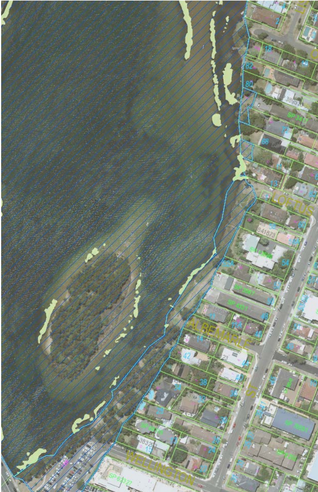
Southern Section, showing seagrass, cadastre and NLSP boundary