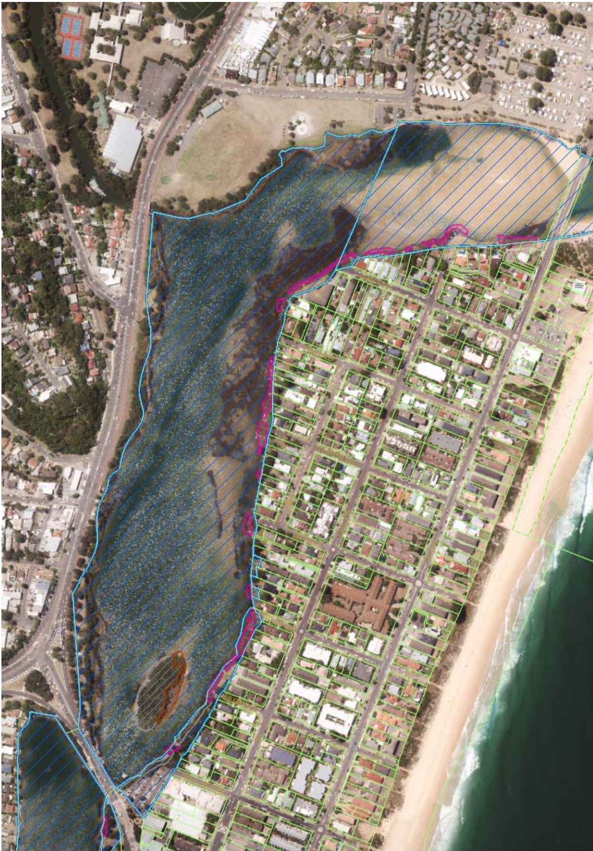
Narrabeen Lagoon Eastern Channel, site of suggested walkway showing endangered ecological communities, cadastre and NLSP boundary