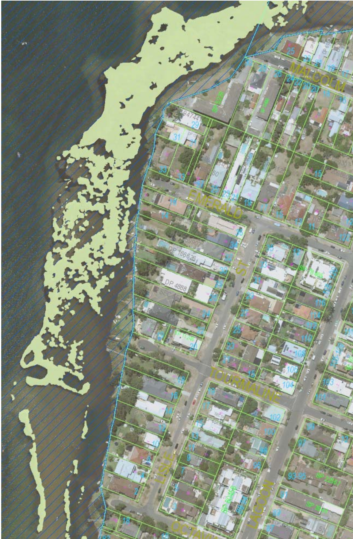
Middle Section, showing seagrass, cadastre and NLSP boundary