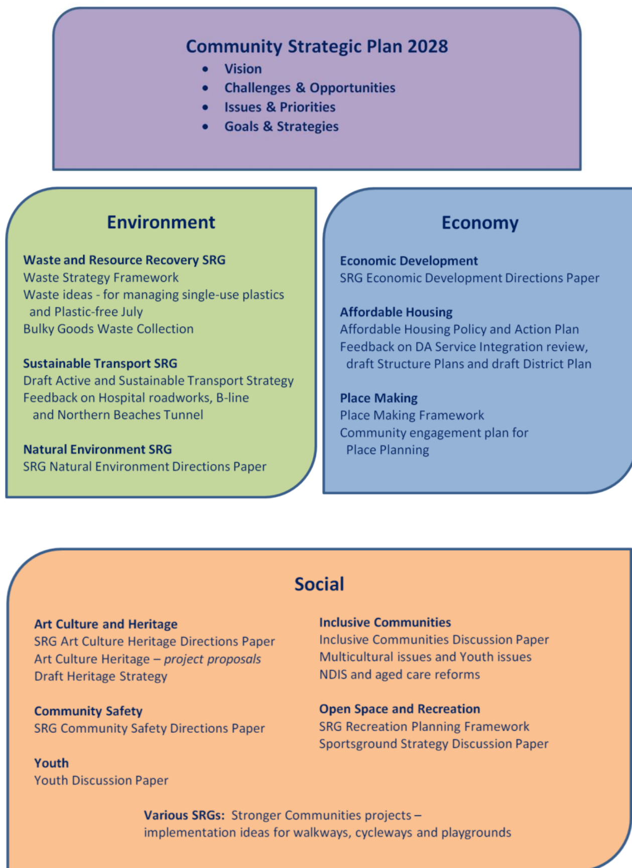
Fig. 1 - Strategic contribution of the SRGs