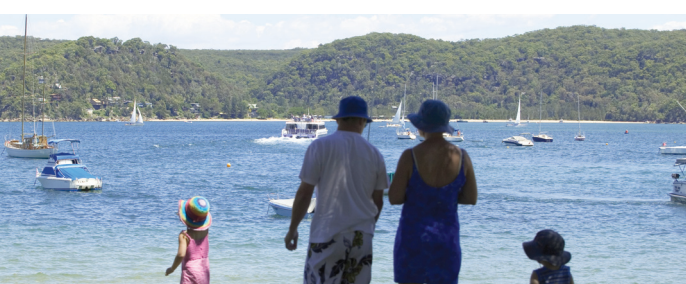
Looking across Pittwater to the National Park