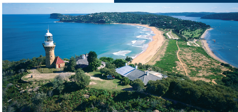
View south from Barrenjoey Lighthouse (David Messent)