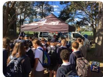
The BEN Careers Expo