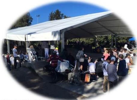
Dam Am Australia