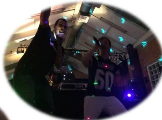
Discobility Dance Party