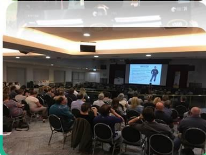
NBYI & NBC&FI