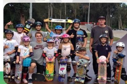
SB NSW & Monster Skate Park