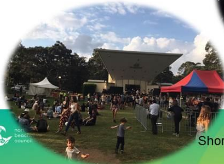
Shoreshocked All Ages Music Festival