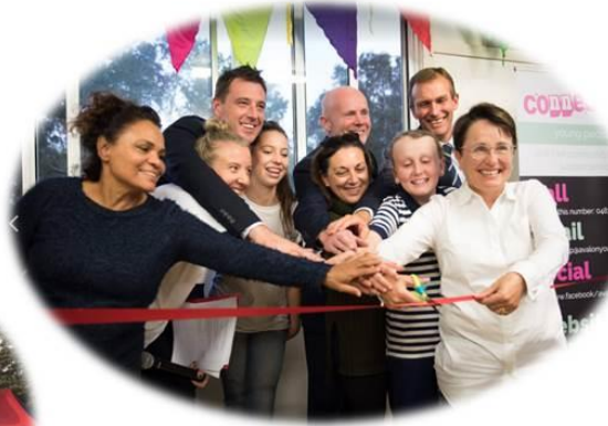
Avalon Youth Hub