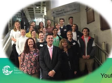
Youth Advisory Group