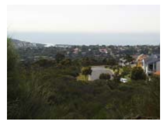
View to Collaroy