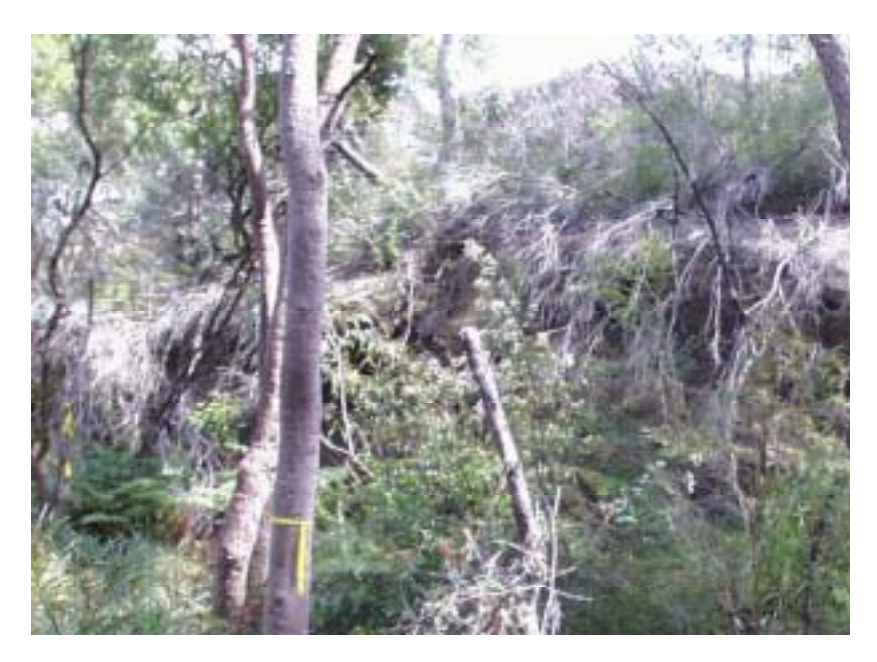
Rock ledge, Golden Grove

The natural attributes of the sites are its main asset. The natural bushland, rock escarpments, and views of the ocean and surrounding areas were elements valued by the local community. The result of this is the preference for passive recreational pursuits and for bushland restoration to be high on the agenda. The community saw the protection of the flora and fauna as being very important. The natural bushland setting was seen as the desired character for all future works on the site. The area acts as an important link to the adjacent Garigal National Park, and was seen as the last remaining bushland area for local children to walk through.