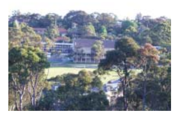
View across to Beacon Hill High School