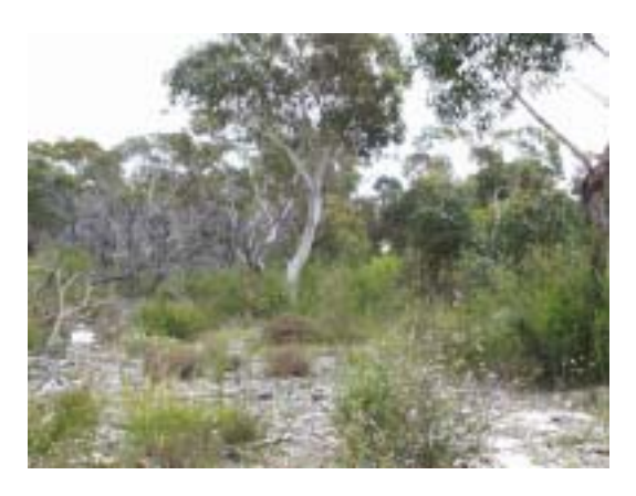
An area previously damaged by fire, Golden Grove.

Although no Aboriginal sites were found within the study area during the investigations, there are many sites of national significance within the surrounding areas which require careful consideration in terms of access, avoiding development pressure and vandalism. Should any developments within the subject sites require the disturbance of soil or vegetation from or adjacent to rock platforms, a representative from the MLALC should be present and any relics found should be recorded by an archaeologist.