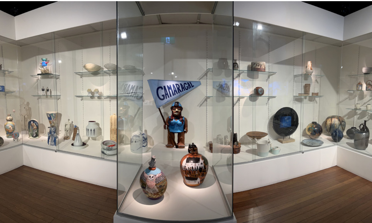
Lady Askin Ceramics Gallery, Manly Art Gallery & Museum