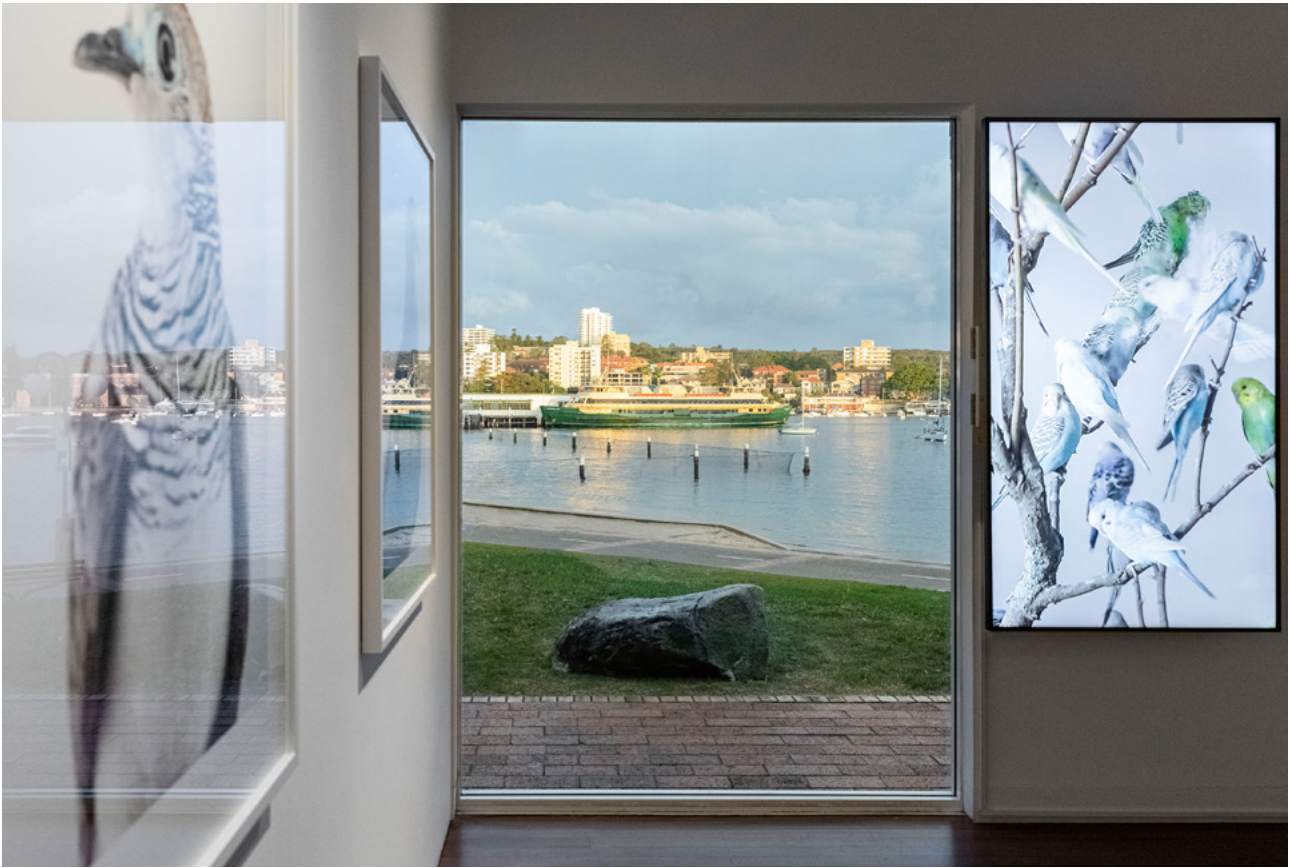
Leila Jeffreys, Birdland, 2020

The commitments in this Strategy will be prioritised and included in MAG&M's annual operational and business plans over the period 2024-2030. A final strategy evaluation in 2030 will contain an evaluation of our performance against the Strategy outcome indicators. Council will monitor and review our ongoing progress by keeping track of the progress of key actions and specific fundraising campaigns.