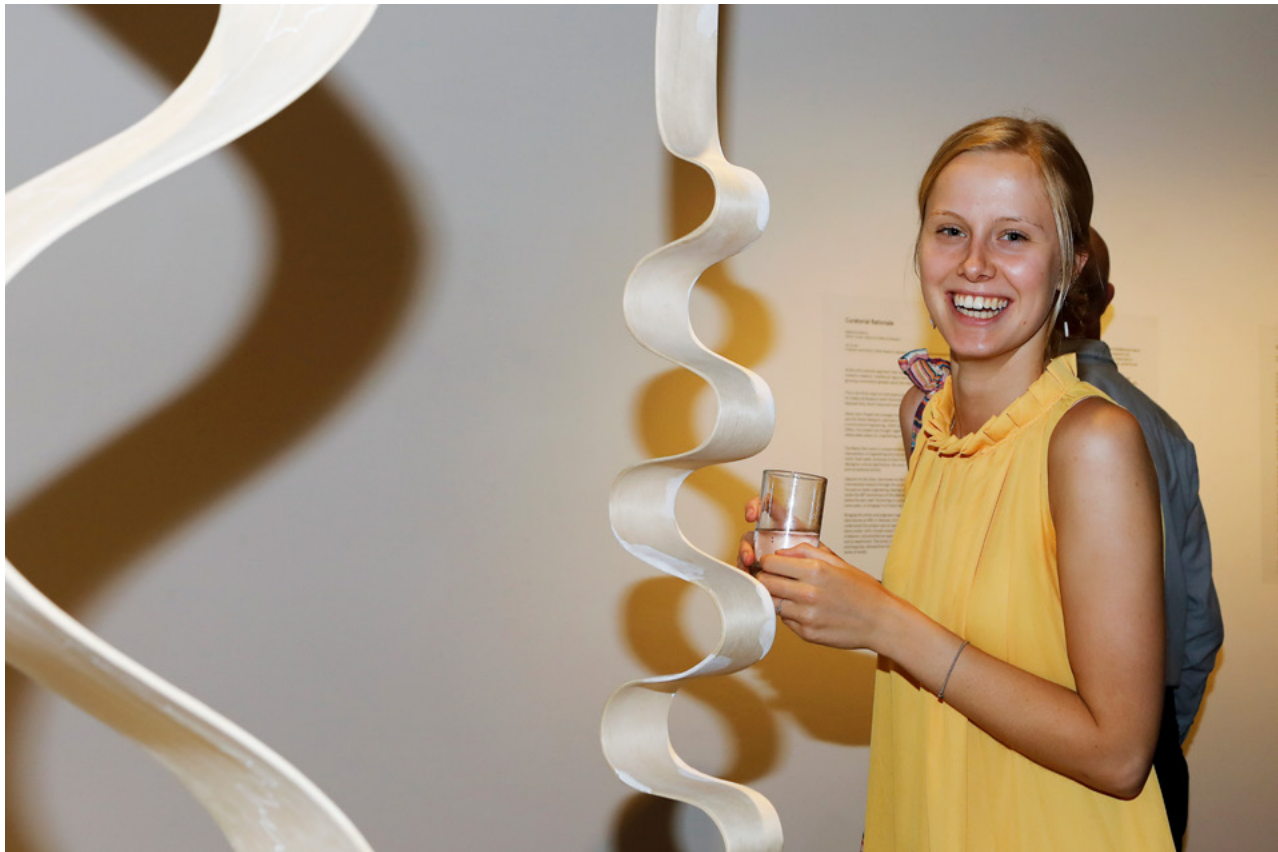
Viewing of installation work by artist Cathe Stack, Manly Dam Project, 2019