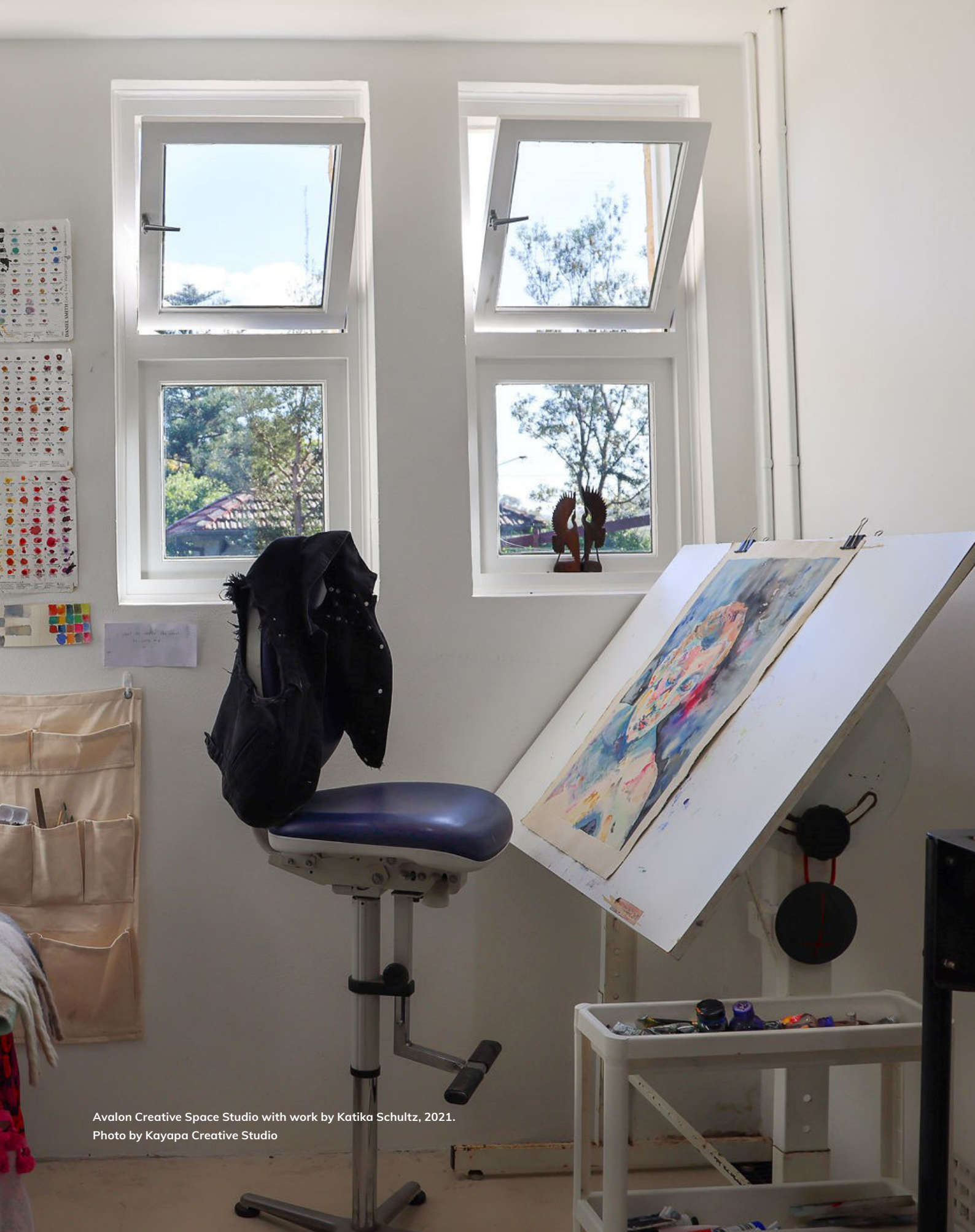
Avalon Creative Space Studio with work by Katika Schultz, 2021.