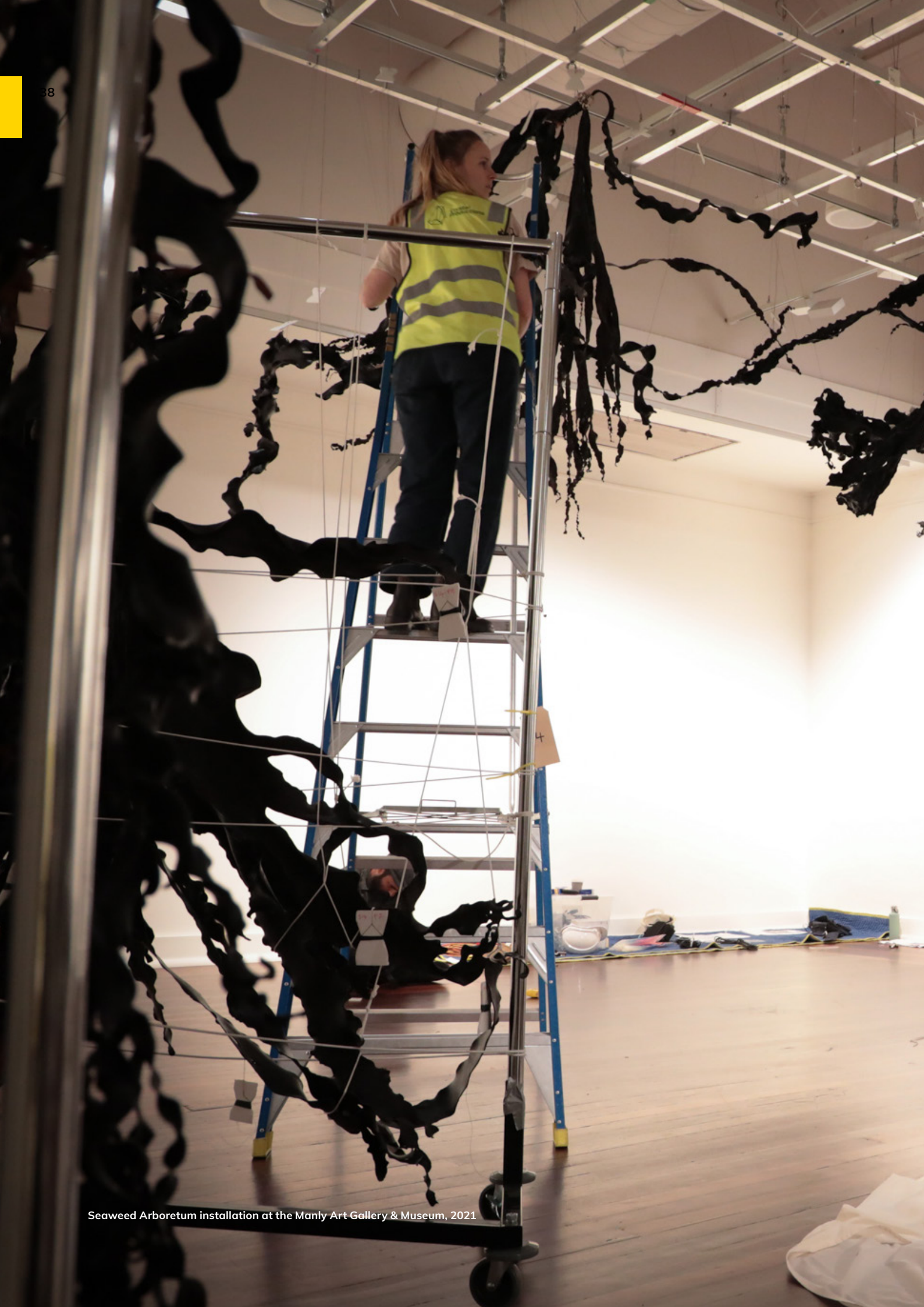
Seaweed Arboretum installation at the Manly Art Gallery & Museum, 2021