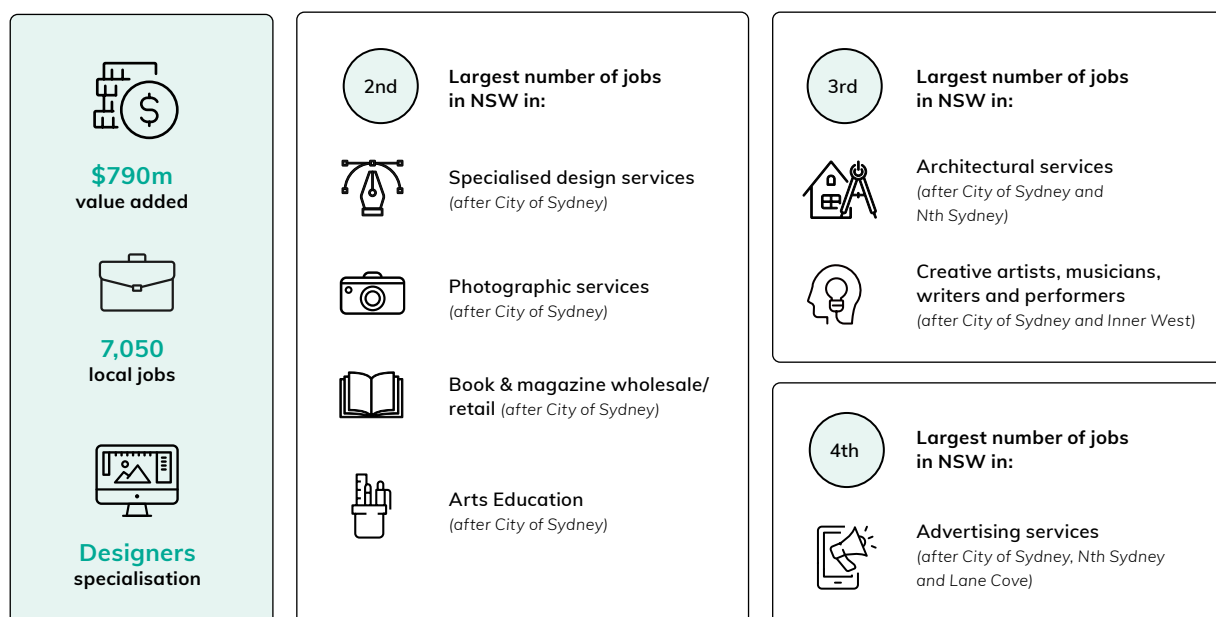
Fig 1. Snapshot – the Northern Beaches cultural and creative sector

Data source: Id Economic Insights . (2021). Northern Beaches Cultural & Creative Sector, https://www.ideconomicinsights.com/northern-beaches-cultural-creative , accessed June 2021.