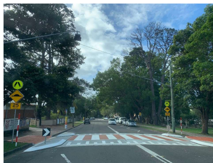
Completed pedestrian crossing – Hill Street, Balgowlah