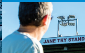
Jane Try Stand