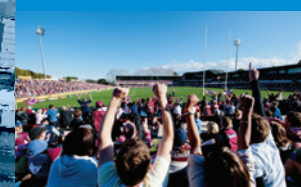
Manly Warringah Sea Eagles