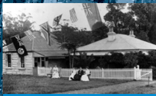
Brookvale House, 1910

Mostly footpath, some verge walking, occasional steps, gentle hill