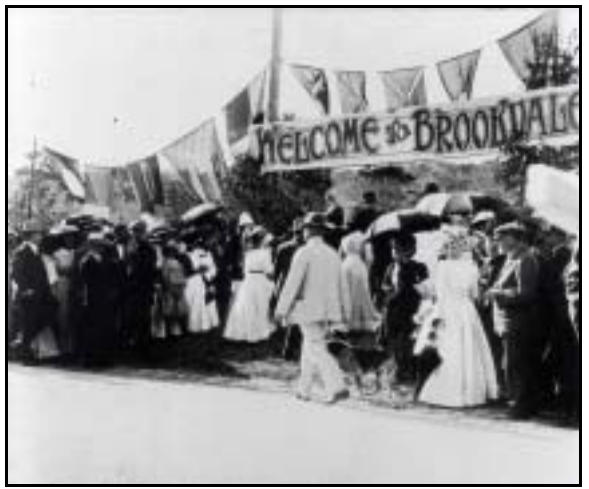
Photo 1: Official Opening of Brookvale Park, 4 March 1911 (source: Manly, Warringah & Pittwater Historical Society Inc.).