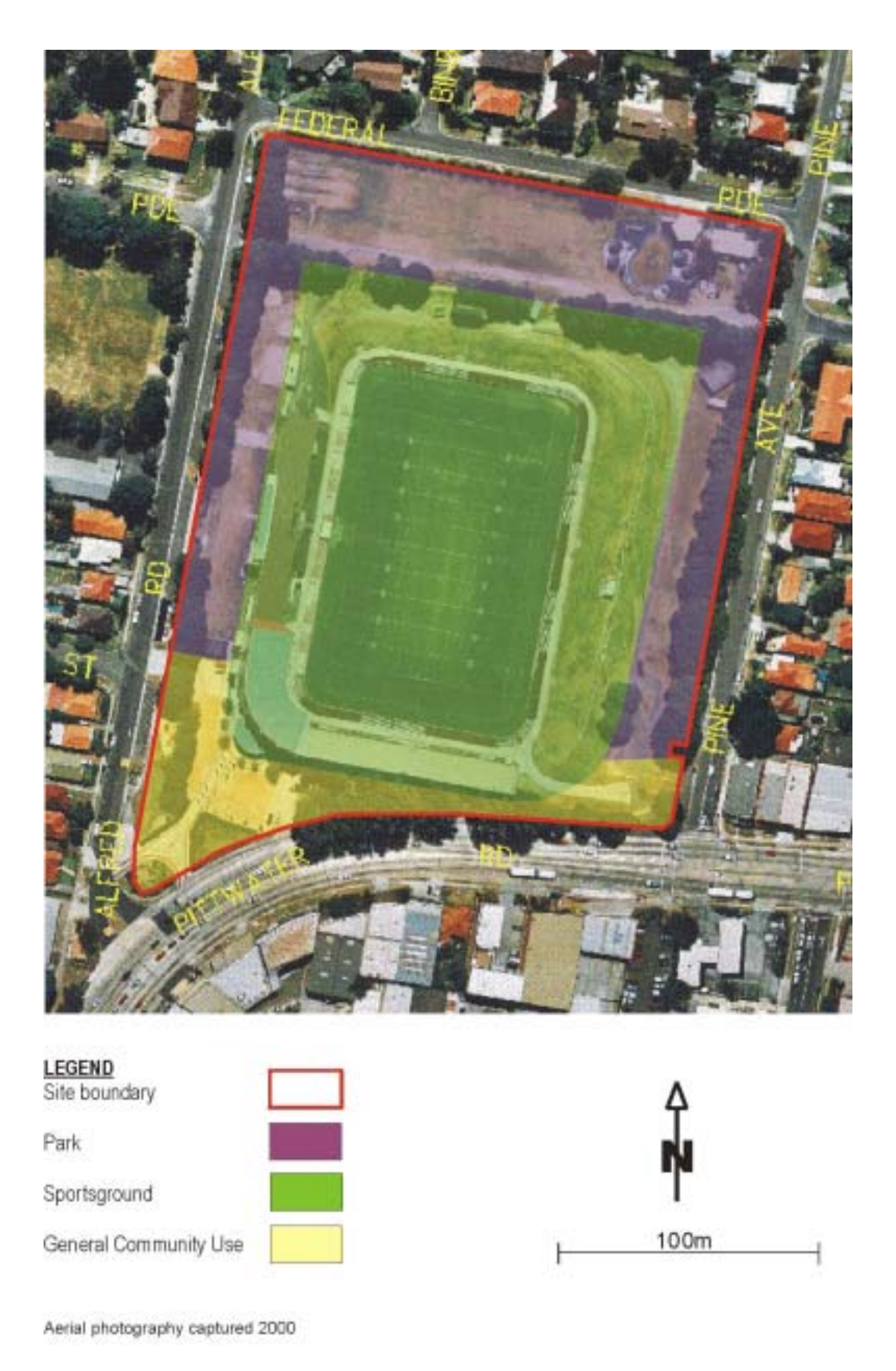
Figure 4: Community Land Categories at Brookvale Park