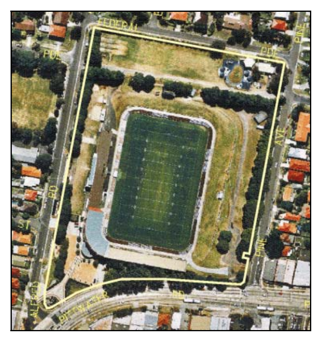
Figure 2: Aerial view of Brookvale Park