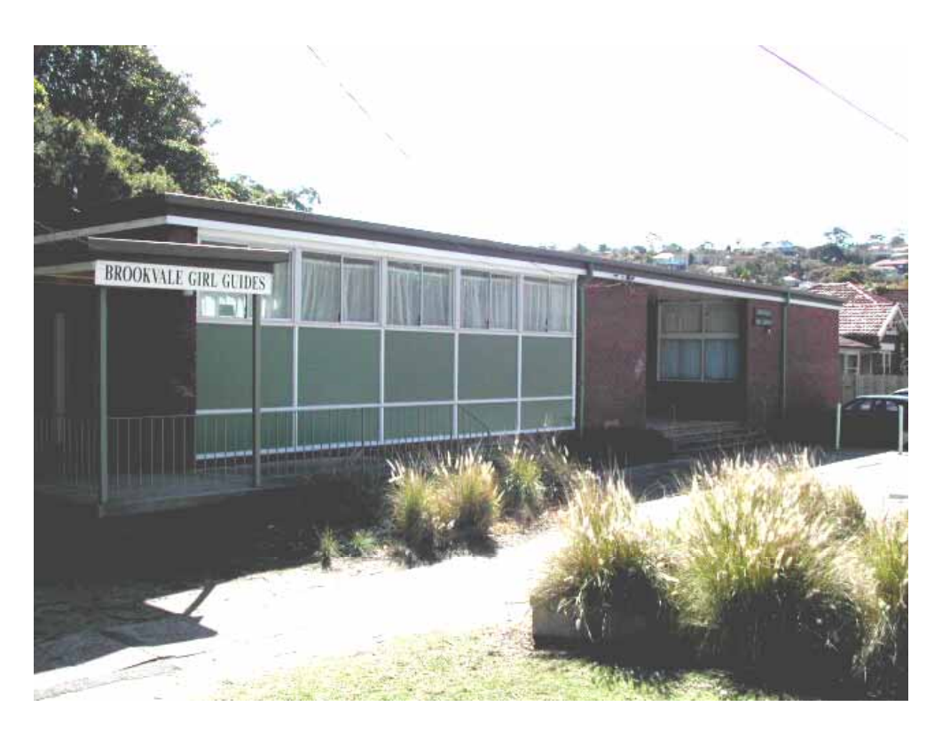
Figure 2. Existing building – Alfred Street façade