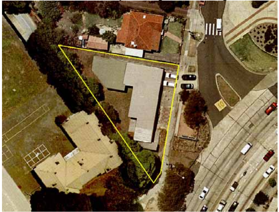
Figure 1. Brookvale Community Building Plan of Management Location

• The subject land is located within an area characterised by a wide range of land uses. These include recreation and open space, transport, commercial and retail, community uses and institutions, and low-density residential areas. The site is strategically located in terms of access by pedestrians, vehicles and public transport.